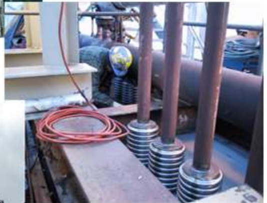
Expansion Joint Boot Installation