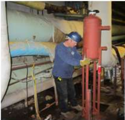
Blow Down Separator